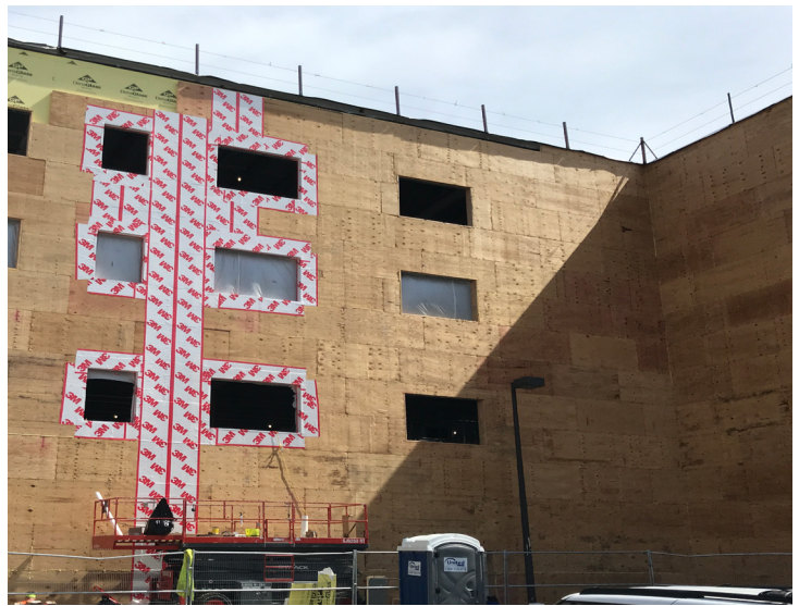
Steel Stud, Dens Glass, Ecomaxci FR Ply, 3M Sheet Good AVB, and followed by ACM Panels